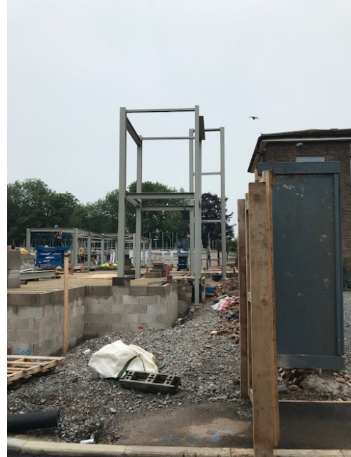
The steelwork is finally going up at the Hub!