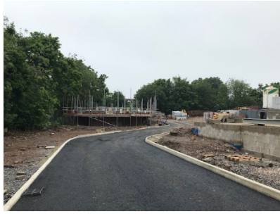
New Road is being laid