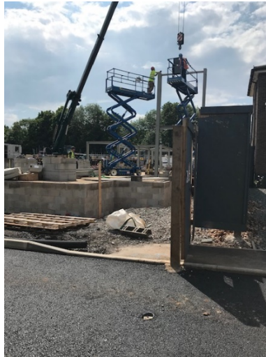
Steelwork is being delivered and erected by a huge crane!